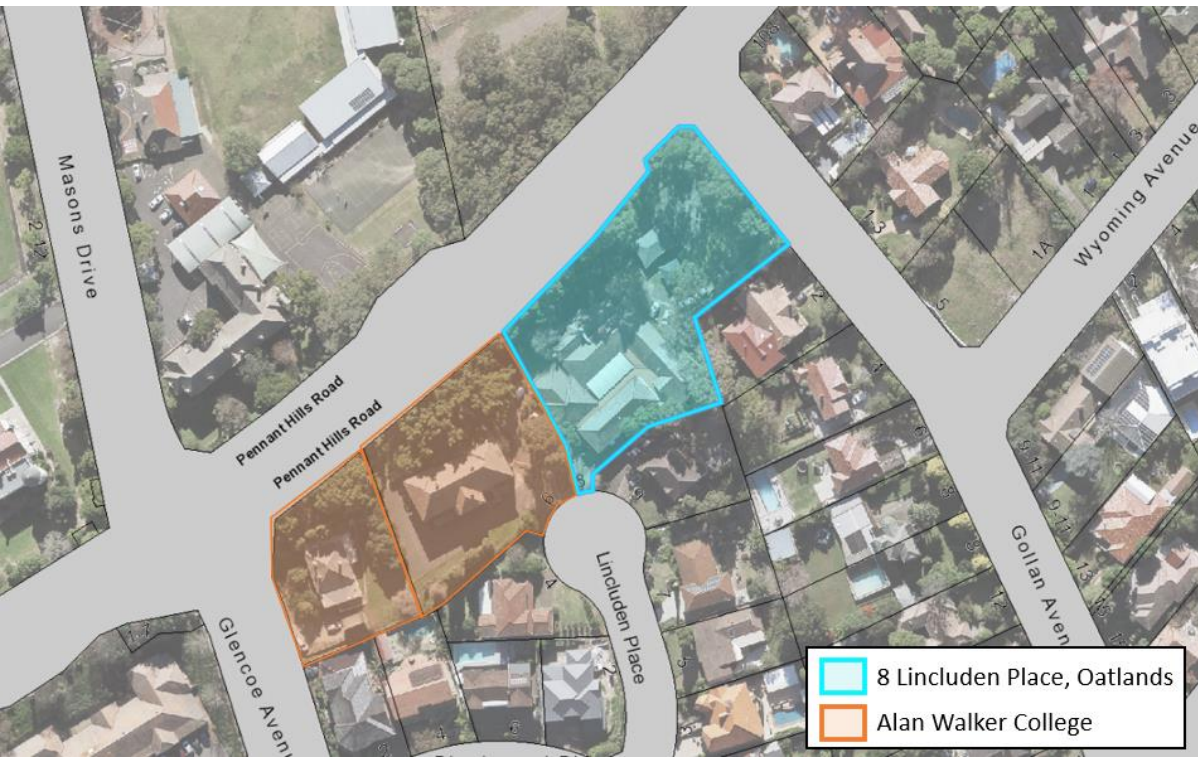
Figure 1 – Site at 8 Lincluden Place, Oatlands, subject to the Planning Proposal